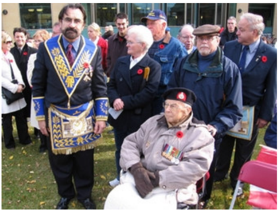
Markham Remembrance Service