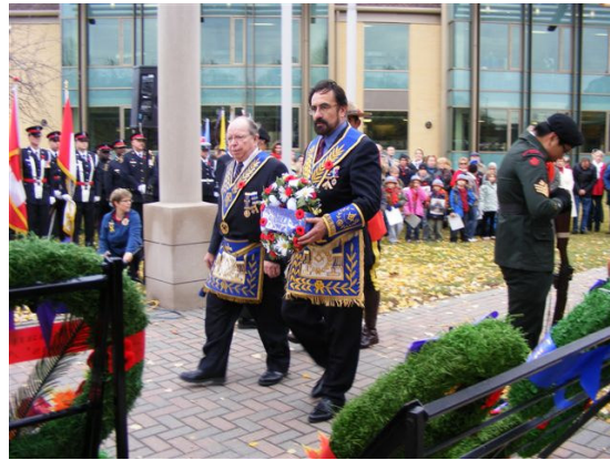
Scarborough Remembrance Service